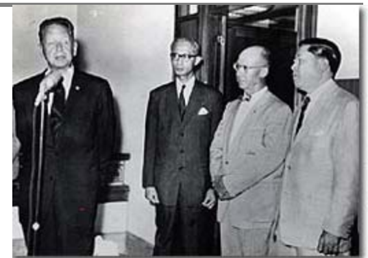
Opening of Mekong Committee office in Bangkok by Dag Hammarskjold (left), Secretary-General of the United Nations, 1959